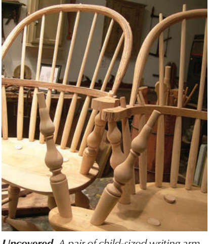
Uncovered. A pair of child-sized writing arm chairs "in the white" reveal some details of the joinery.