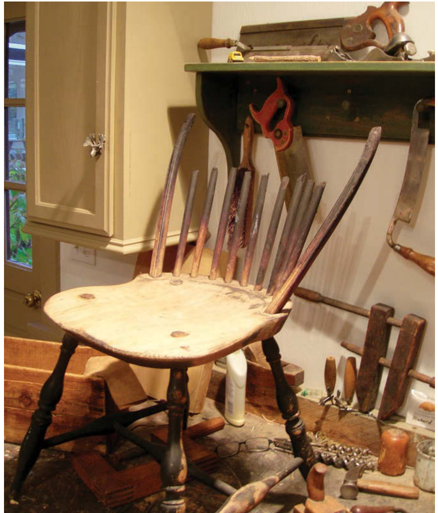
Trial by fire. The Windsor chair epitomizes timeless function, beauty and strength; it can hold up to even the harshest of tests, as did this graceful bowback that endured a house fire and three years of exposure to weather.