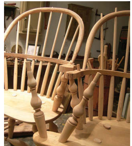
Uncovered. A pair of child-sized writing arm chairs "in the white" reveal some details of the joinery.